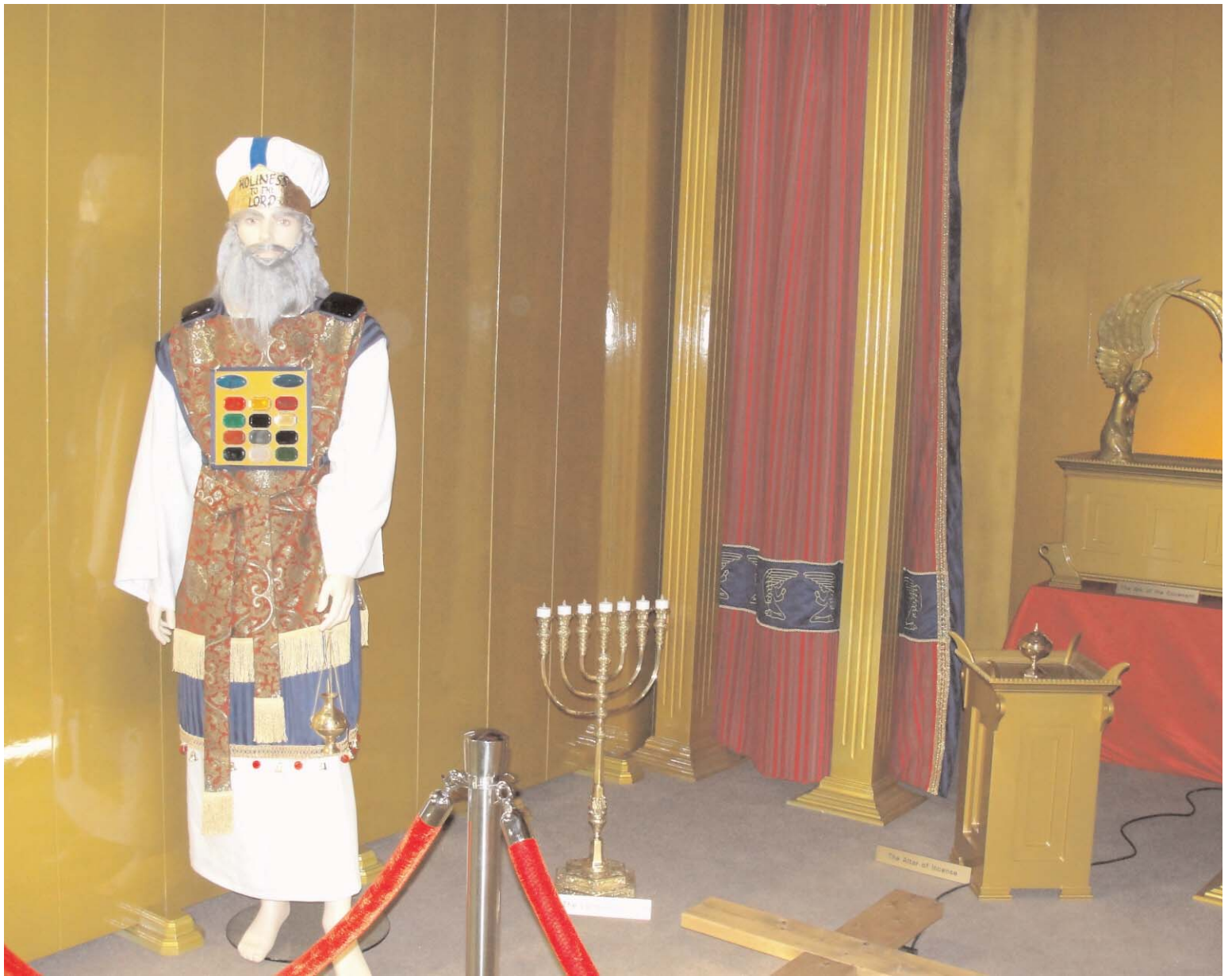
Seventh Day Adventist Booth Across the Aisle and One Booth Over