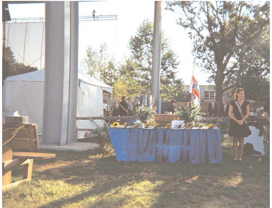
Memorial Table with Fliers on it To the left was the Free Stage where Memorial speeches were given.

During the religious service a wind lifted one sheet, so I jumped up and put my little Bible as a paperweight, standing upright on the stack. The Mayor and several other officials spoke. The front two rows were for the families of the five victims. We watched as they cried through the service, holding each other in their arms. It was so emotionally touching you could not keep the tears back. I prayed that somehow, some way, we would have an opportunity to give them all fliers.