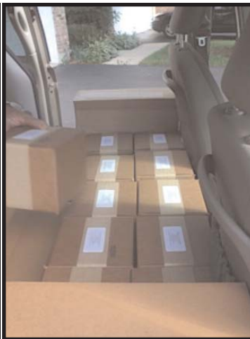
All Lined Up