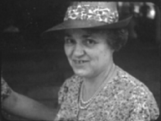
??? and ???